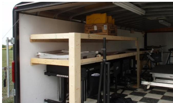
This is a view of the rear of the trailer. You can see we assembled 2 shelves to the back of the trailer.