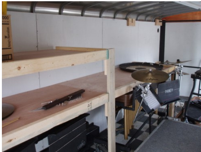
Here is a picture of the shelves. Only 1 level of shelving towards the front and two levels towards the rear of the trailer.